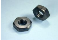
BRASS - BL.OX.