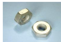
BRASS - TIN PLT.